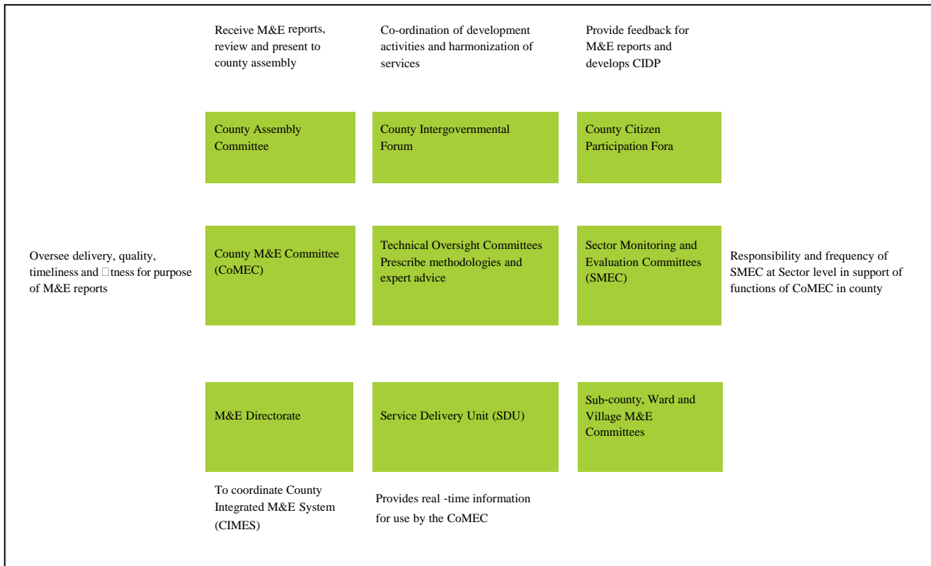
Figure 5.1 Monitoring and Evaluation Structure

To facilitate M&E of the CADP, the County will seek to progressively operationalise the various M&E committees as per the CIMES guidelines namely; County Monitoring and Evaluation Committee (CoMEC), Sector Monitoring and Evaluation Committee (SMEC), Technical Oversight Committee (TOC), Sub-County Monitoring and Evaluation Committee (SCoMEC) and Ward Projects Identification Committee (WPIC) based on existing capacity. The committees will be responsible for tracking and reporting on implementation of various programmes and projects in the plan. The committees will also identify and plan for evaluation of various programmes and projects.